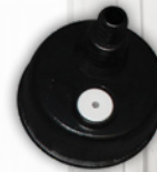
Vented Stepped Cap with Dip Tube