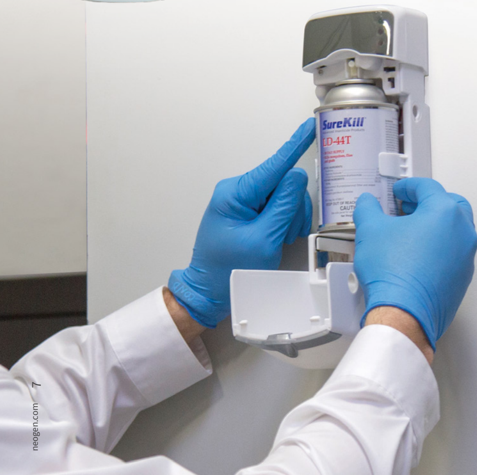
LD-44T installation in ProMist'r Dispenser

The ProMist'r Dispenser is an automatic dispenser that delivers a metered spray at selected intervals to rid an area of unwanted flying insects. Easy to open and refill, and easy to program to spray at different time intervals with options for day, night or 24-hour operation. For use in restaurants, warehouses, lavatories, commercial buildings, and other labeled indoor spaces where insects can be a nuisance.