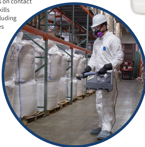
Fogging concentrate application