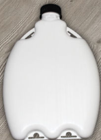
1 L Back Pack